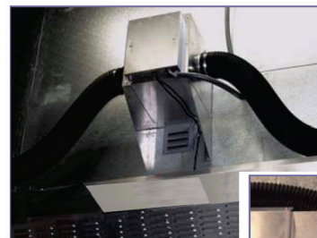
Condensation Management System (CMS)