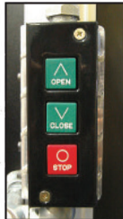
Nema 1 - 3 Button Controller