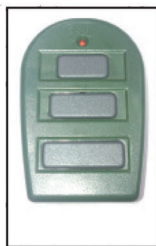
RF with Remote Control