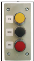
Nema 4 Wired Controller (Standard)