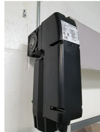
Direct Drive Motor