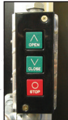
Nema 1 3 Button Controller